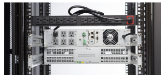
The FlexPDUs and HotSwap MBPs can also be rackmounted either horizontally or vertically