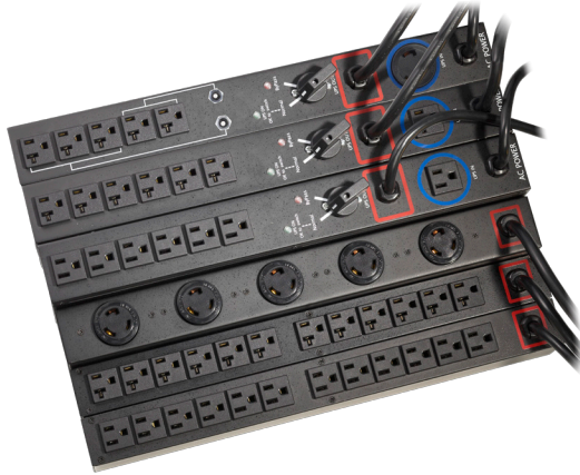
FlexPDUs and HotSwap MBPs