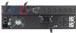
Top mounting horizontal

Even more, the 1U and 2U form factors of the FlexPDU and HotSwap MBP make the products easy to deploy even in a space-constrained environment. In addition, a variety of mounting options allow for flexible installation, with the ability to mount the units on the rear panel, the top, on the left or on the right of rackmount and rack/tower UPSs.